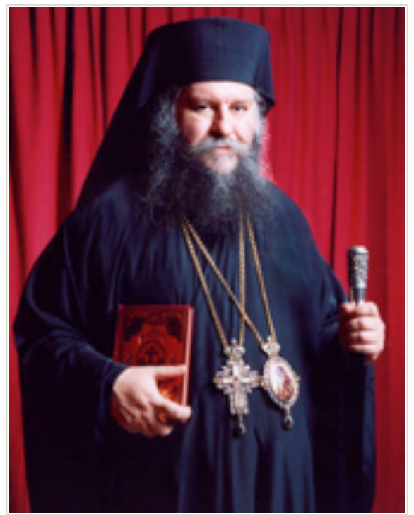
Photo: Metropolitan Pavlos of Astoria, NY (b. 1955)

"Encyclical Regarding Holy Communion", 2002: Met. Pavlos